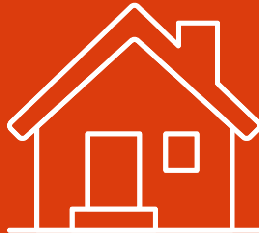
እንተ ተጸሊኡካ/ሐሚምካ ካብ ገዛኻ አይትውጻኝ