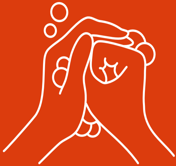
አእዳውካ ቀቀልጢፍካን ብግቡኝ አጽሪኻን ተሐጸብ